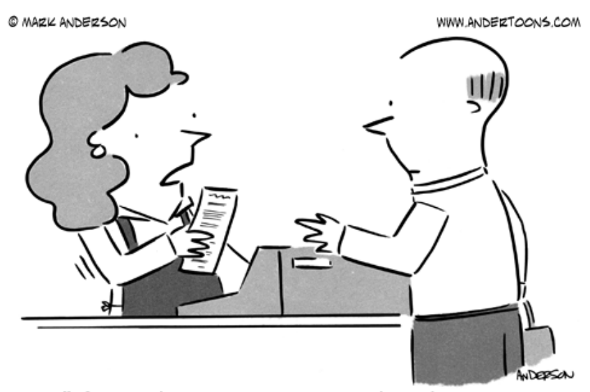
"If you take a moment to complete the survey at the bottom, you'll be the first."